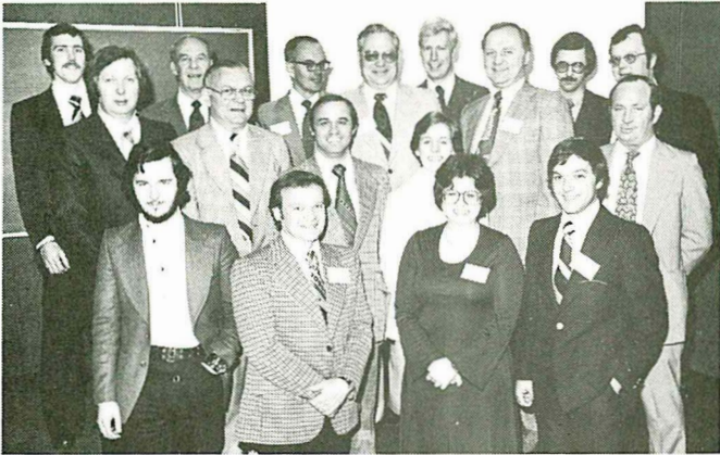
Taking a break — Chevrolet and Wheelabrator personnel smile for our photographer.